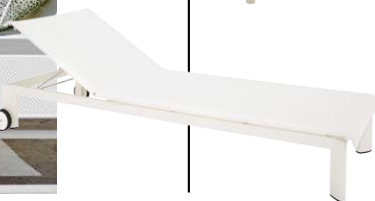
Toulouse 4 pendant lights, Lights Lights Lights. Calm sunloungers and Illum dining table, all Cosh Living. Lucy dining chairs, Cotswold InOut Furniture. GET THE LOOK Right, from top Black Sands beach umbrella, $249, Sunday Supply Co. Olive and Stripe Olive polyester outdoor cushions, $39 each, Domayne. Slowtide 'Hala' cotton velour beach towel, $54, Fruugo. Lucy stacking side chair, $1037, Janus et Cie. Delray stainless-steel day bed, $999, Eco Outdoor. For Where to Buy, see page 230.